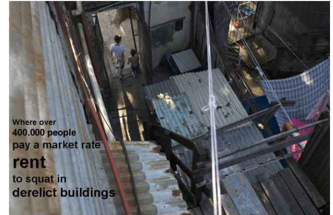
Where over 400,000 people pay a market rate rent to squat in derelict buildings