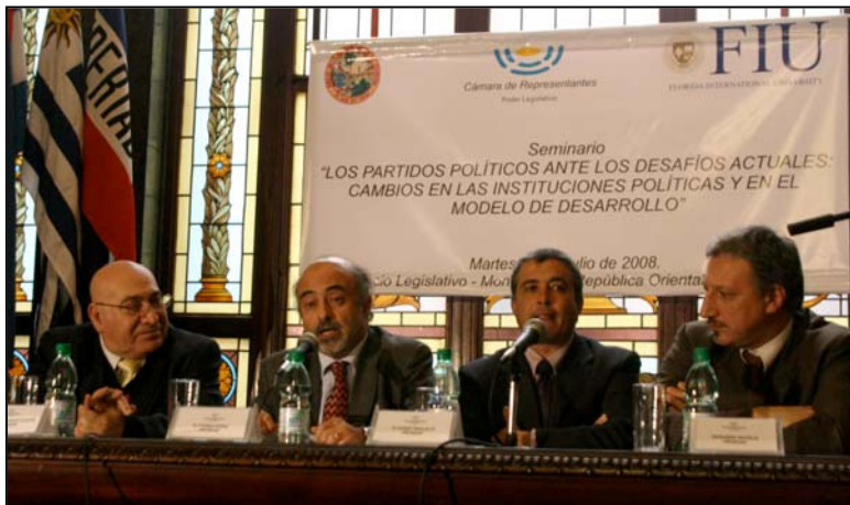
Journalist table present their views at the conference.