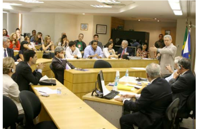
Seminar participants at the Getulio Vargas Foundation.

In preparation for Florida’s First Conference on Good Governance and Democracy in the Hemisphere planned for Oct 2-3, 2008 at the Biltmore Hotel, the Institute for Public Management & Community Service (IPMCS) of FIU co-hosted a one-day seminar with the foremost public management school in Brazil, the Brazilian School of Public Administration of the Getulio Vargas Foundation (FGV), in Rio de Janeiro, July 25.