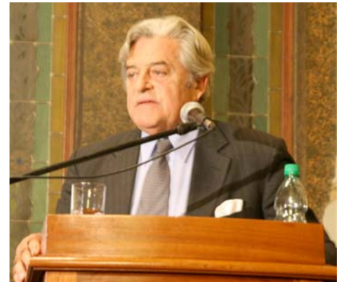
Former president Luis Alberto Lacalle Herrera concluded the seminar.

In preparation for Florida’s First Conference on Good Governance and Democracy in the Hemisphere planned for Oct 2-3, 2008 at the Biltmore Hotel, the Institute for Public Management & Community Service (IPMCS) of FIU co-hosted a seminar with Uruguayan House of Representatives at the National Legislative Palace in Montevideo, Uruguay on July 29.