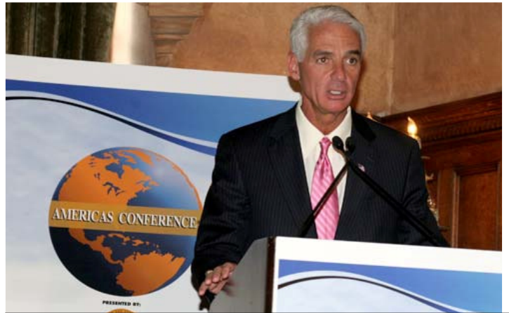
Governor of Florida Charlie Crist

As a final event in the State of Florida’s Project on Good Governance and Democracy in the Hemisphere, the Institute for Public Management & Community Service (IPMCS) of Florida International University (FIU) organized, in partnership with The Miami Herald and the Inter-American Development Bank (IDB), the Americas Conference, held on Oct 1-3, 2008 at the Biltmore Hotel. The theme of this two and half day event was New Leadership-New Focus: Good Governance and Economic Development in the Hemisphere. More than 500 people representing the private sector, government and non-profit organizations from Miami and throughout Latin America and the Caribbean participated.