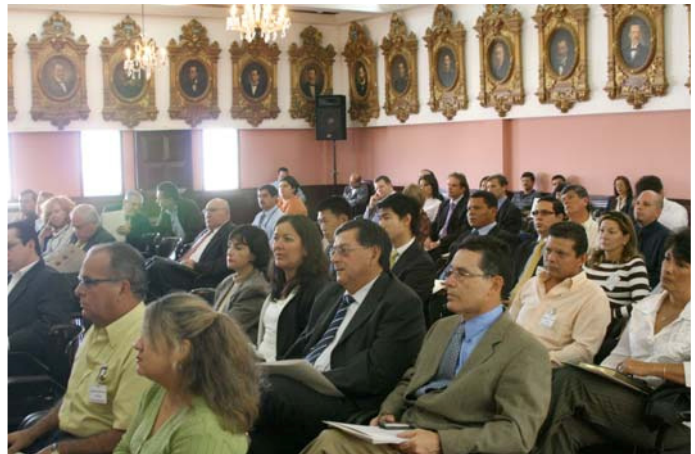
The audience at the March 14 seminar

The first trip on January 30 provided space for introductions with various leaders. Through meetings and