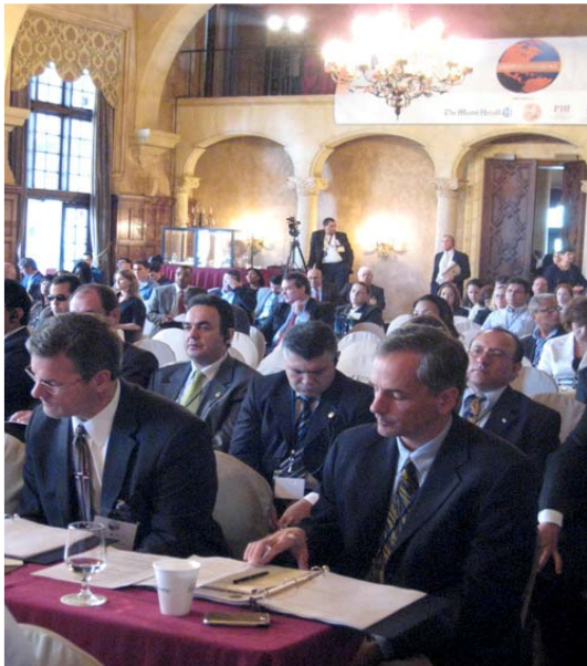
The audience at the conference.