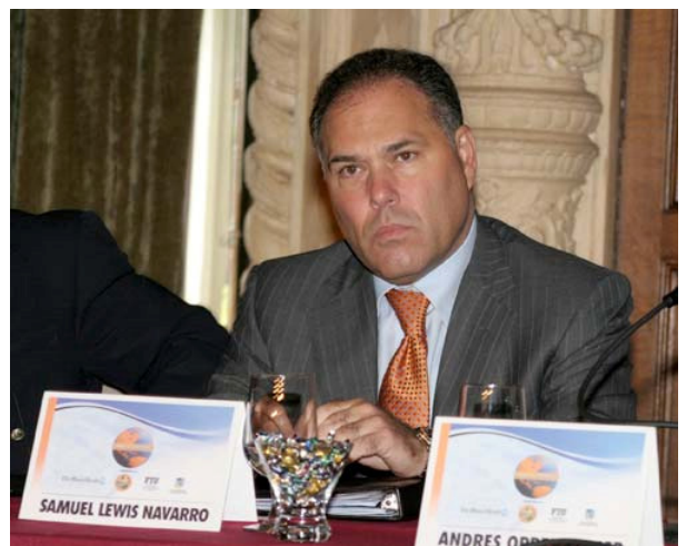
Vice President Samuel Lewis Navarro