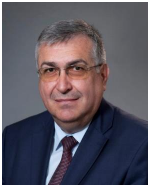
Hon. Georgi Bliznashki (Bulgaria)